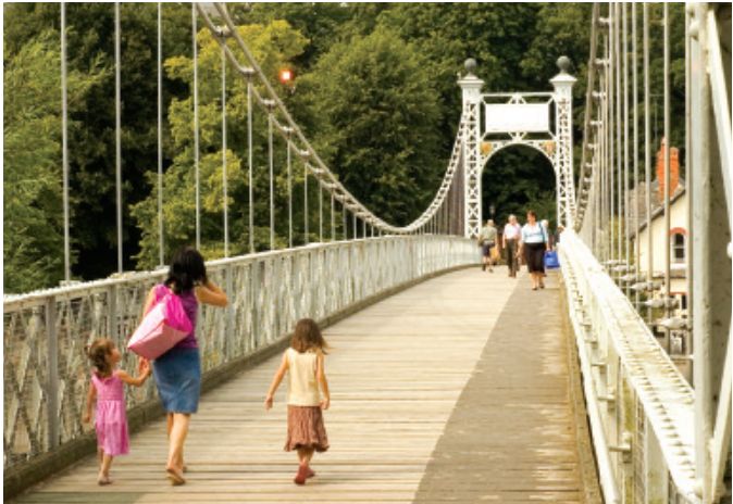
Above: Queen's Park bridge.