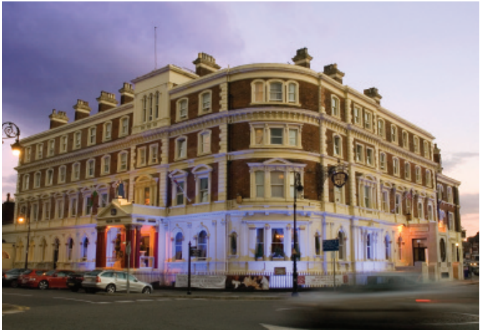
The Queen Hotel is located directly across from Chester Railway Station.