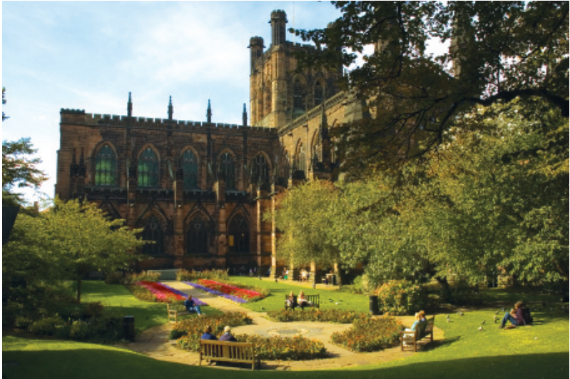
Chester Cathedral is the most complete medieval monastic complex still standing in Britain.